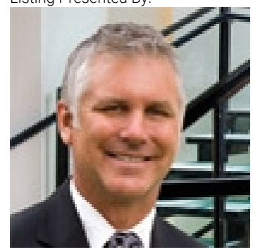
Originally Listed by: RE/MAX Kelowna