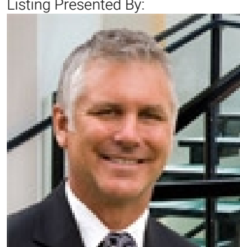
Originally Listed by: Royal LePage Kelowna