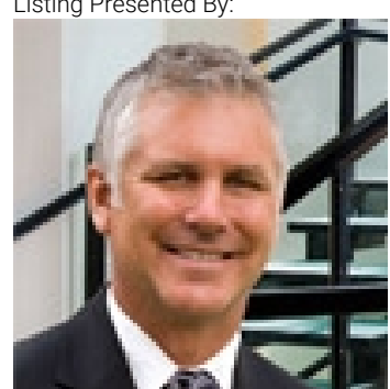
Originally Listed by: RE/MAX Kelowna