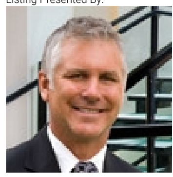
Originally Listed by: Royal LePage Kelowna