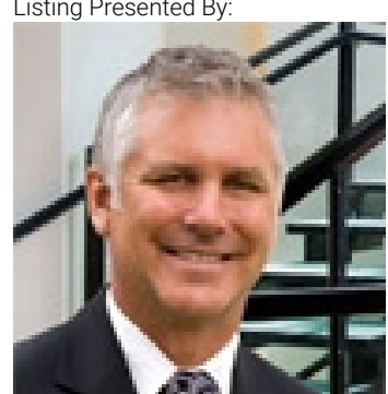
Originally Listed by: Chamberlain Property Group