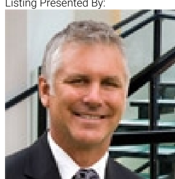
Originally Listed by: Royal LePage Kelowna