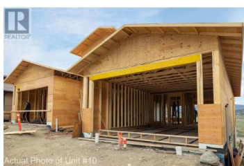
Actual Photo of Unit #10