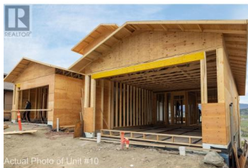
Actual Photo of Unit #10