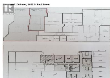
Office Level 200, 1461 St Paul St.