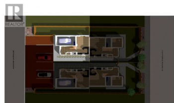
11612 VICTORIA ROAD S. - LANDSCAPE PLAN