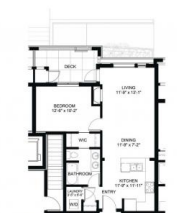
FLOOR PLAN F (1st FLOOR)

Designed for comfort and connection, this ground-floor 1-bedroom suite offers the ideal blend of private living and community spirit. Enjoy quartz counters, soft-close cabinetry, heated tile in the bathroom, and engineered hardwood throughout. The walk-through closet, electric fireplace, and built-in A/C make everyday living feel upscale and easy. Step onto your private patio or head out to enjoy the onsite community garden, meeting rooms, and walkable surroundings. Perfect for those looking to simplify without sacrificing quality or lifestyle. Expected possession September 2025. Appointments required for viewings, contact Listing Agent for available times. BUILDER INCENTIVE includes a 55" flat screen LG LED TV and 1 year strata fees paid on next 6 units sold, contact for details! (id:6769)