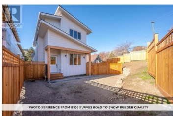
PHOTO REFERENCE FROM SIDE PURVES ROAD TO SHOW BUILDER QUALITY