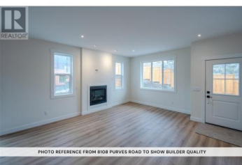
PHOTO REFERENCE FROM SIDE PURVES ROAD TO SHOW BUILDER QUALITY

Brand new half duplex near Giants Head Elementary in Summerland! Two storey, 2297 sqft, 4 bed, 3 and 1/2 bath home. Best part is no strata fees and no restrictions! Main floor with open concept living room to kitchen with all new appliances, a 2pc bath, storage room plus a flex room - use as 5th bedroom, rec room or office space! Upstairs you will find your primary bedroom with large walk-in closet and 4pc ensuite, 2 bedrooms, another 4pc bath & separate laundry room! Private fenced yard with patio and 2 off street parking stalls. Efficient ductless heat pumps provide the heating and air conditioning allowing clean lines in the unit and no drops in the ceiling, plus an HRV unit to help increase energy efficiency. 200 amp electrical service, roughed in for an EV charger and prewired for a home theater in the lower level rec room. Take comfort in with the protection of the 2/5/10 new home warranty. Near Dale Meadows sports fields, close to Giants Head Mountain Park, and a short distance to all downtown Summerland has to offer! Property is currently under construction with estimated completion early 2025. Contact listing agent for more! (id:6769)