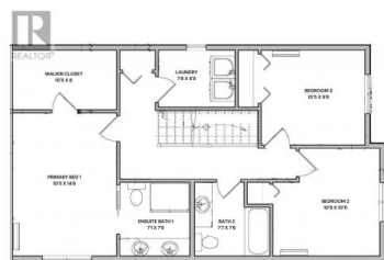
ABOVE FLOOR PLAN