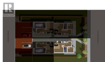
11612 VICTORIA ROAD S. - LANDSCAPE PLAN