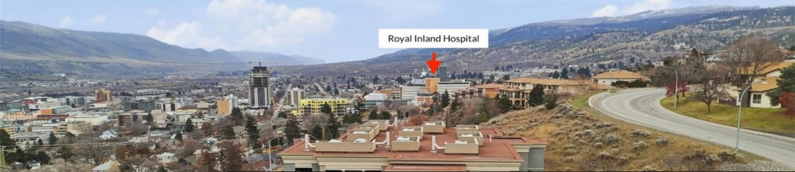
Royal Inland Hospital