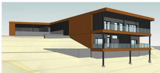
2 3D NORTHWEST PERSPECTIVE