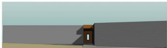
3 3D EAST PERSPECTIVE