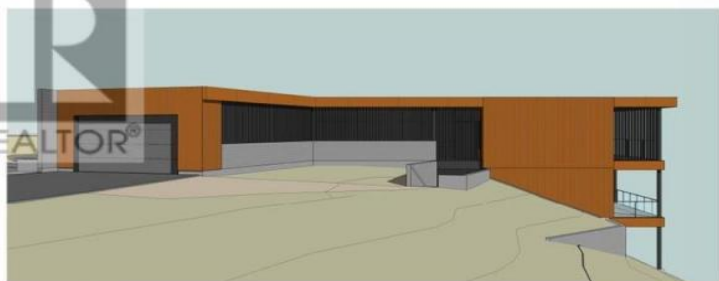
1 3D NORTH PERSPECTIVE