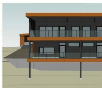
4 3D WEST PERSPECTIVE

111 GRANITE Court Naramata British Columbia Naramata Rural $499,000