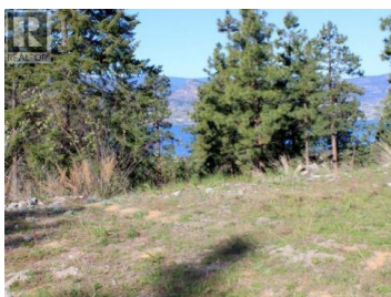
DUKE RESIDENCE - NARAMATA 111 GRANITE COURT, NARAMATA

Prime Naramata Bench lakeview lot. Large estate sized 3/4 acre private lot with beautiful views of Okanagan Lake, Valley, and surrounding mountains. Build your modern dream home. Good building site with house plans and septic plans in place. Neighborhood architectural guidelines give freedom to custom-build the new estate home of your dreams within the beautiful community of rural Naramata, just minutes to the City of Penticton. Located in Stonebrook Benchlands, a custom home subdivision that is just minutes from award-winning wineries, trails, biking/hiking, and of course, the lake. Less than 10 mins to the charming village of Naramata with its school, beaches, parks, historic hotel/restaurant, and shops. Services at the lot line. Seller will include building drawings for a modern home or customize your Naramata dream home today. (id:6769)