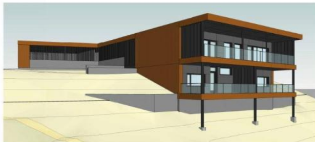
2 3D NORTHWEST PERSPECTIVE