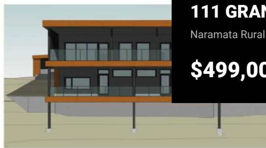
5 3D WEST PERSPECTIVE