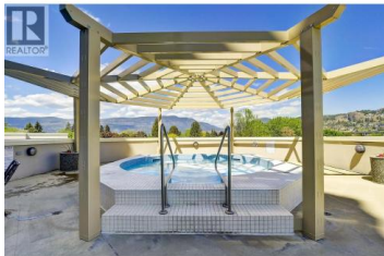
Centuria ffgf (id:6769)