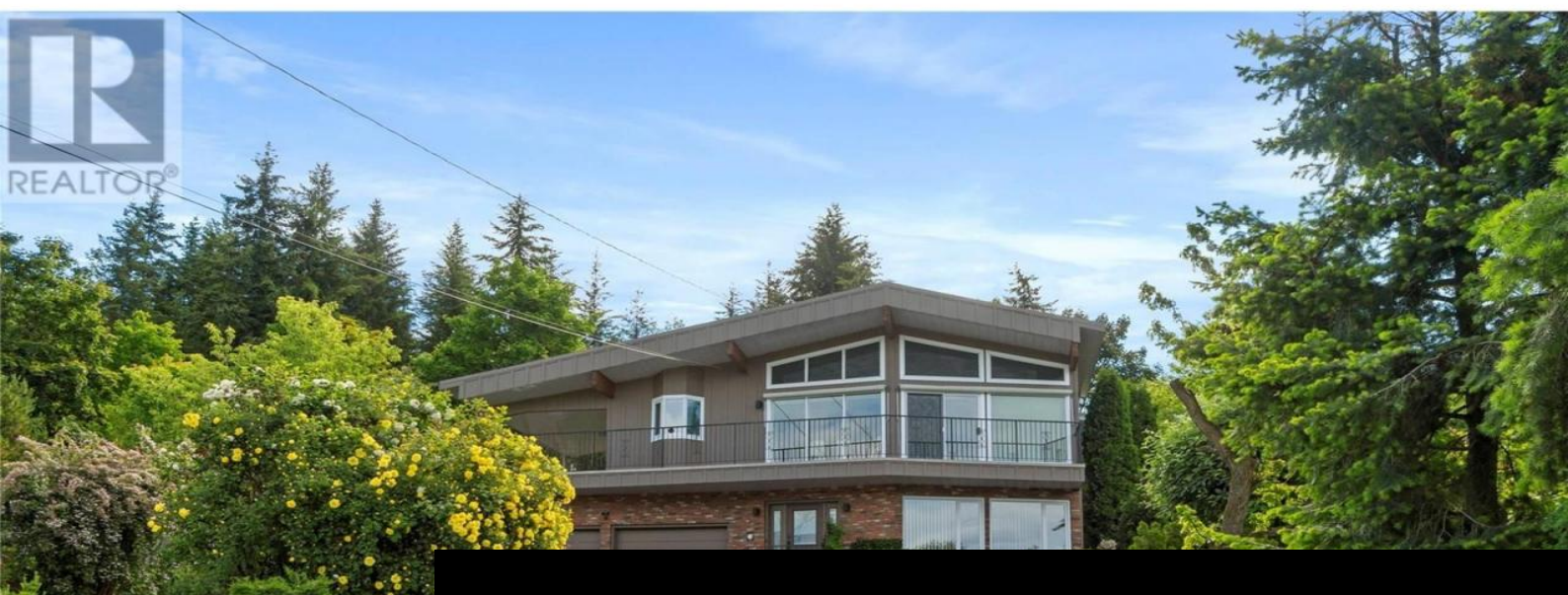
1280 Lakeshore Road Salmon Arm British Columbia NE Salmon Arm $1,197,000