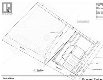
① Site Plan

General Notes: All work to be completed within the specified time frame. The proposed residence is shown for informational purposes only. The actual construction may vary from the rendering.