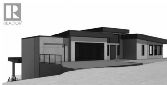
① Front Left Perspective