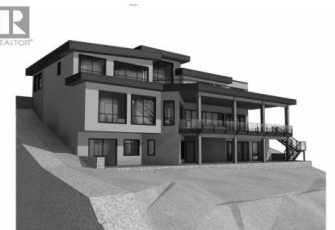
② Rear Left Perspective

General Notes: All work to be completed within the specified time frame. The proposed residence is shown for informational purposes only. The actual construction may vary from the rendering.