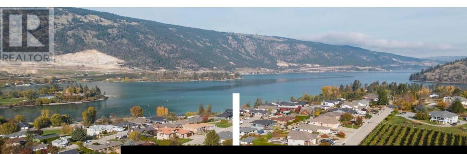
15638 Greenhow Road Lake Country British Columbia Lake Country East / Oyama $815,000