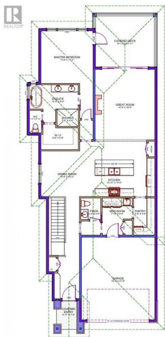
MAIN LEVEL: LIVING AREA: 1,238 SQFT (NOT INCLUDING GARAGE) TOTAL LIVING AREA: 3,006 SQFT