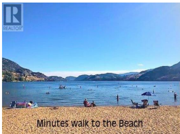
Minutes walk to the Beach