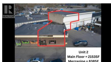
Unit 2 Main Floor = 2153SF Mezzanine = 838SF