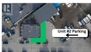
Unit #2 Parking