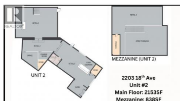
2203 18 th Ave Unit #2 Main Floor: 2153SF Mezzanine: 838SF