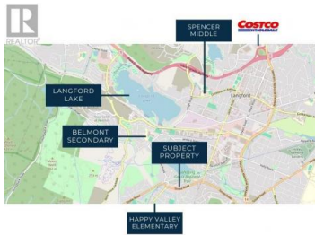
2652 SOOKE RD