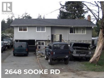
2648 SOOKE RD