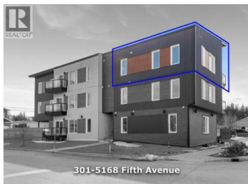
301-5168 Fifth Avenue