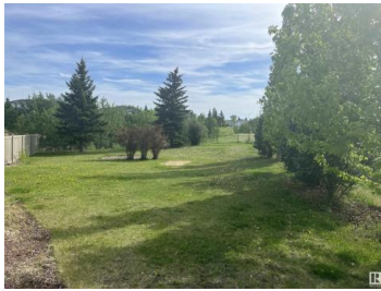
Aerial View 3339 32 Avenue