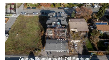
Approx. Boundaries #4, 745 Morrison