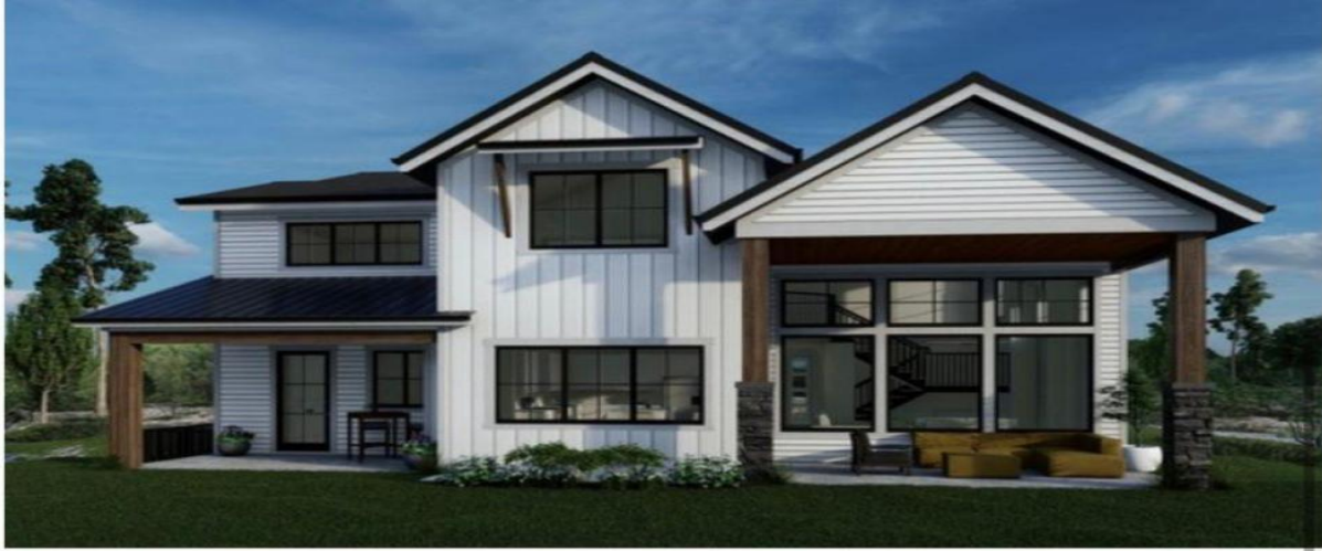
Renderings of approved plans included in the purchase price **Construction of the home is not included in the price