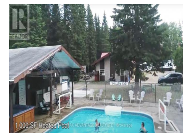
1,000 SF Heated Pool & Hot Tub