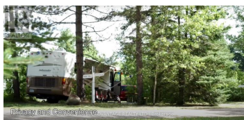
Privacy and Convenience