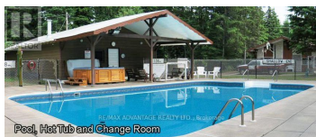
Pool, Hot Tub and Change Room