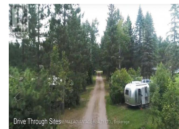
Drive Through Sites

CAMPGROUND/MOBILE PARK. Turn-key Owner Operator/investor opportunity with great cash flows. Lifestyle beckons on this 25-acre site with currently 95 developed sites. The 65 site Campground specializes in Big Rig drive thrus with laundromat, 1,000sf pool & Gift Shop. 30 site 55+ Mobile Park Community with year round monthly rental income. Custom Designed 3-bed family home with store front on site. 20 mins. from Thunder Bay & half mile from Kakabeka Falls. **** EXTRAS **** 3-bedroom split level family home over two floors with cathedral ceilings, rustic beams, & private sauna. This is a once in a lifetime opportunity to benefit from a successful turn-key operation - www.happylandpark.com (id:6769)