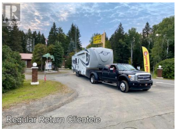
Regular Return Clientele