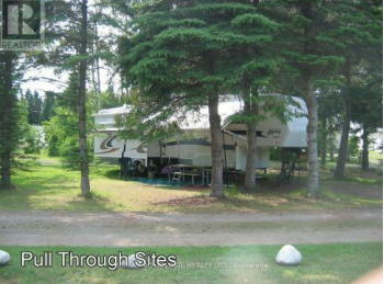
Pull Through Sites