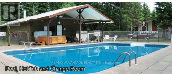
Pool, Hot Tub and Change Room