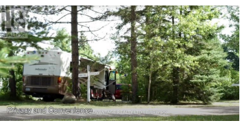
Privacy and Convenience