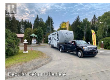
Regular Return Clientele