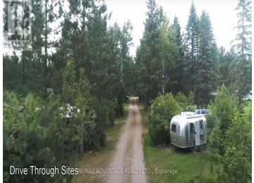
Drive Through Sites

CAMPGROUND/MOBILE PARK. Turn-key Owner Operator/investor opportunity with great cash flows. Lifestyle beckons on this 25-acre site with currently 95 developed sites. The 65 site Campground specializes in Big Rig drive thrus with laundromat, 1,000sf pool & Gift Shop. 30 site 55+ Mobile Park Community with year round monthly rental income. Custom Designed 3-bed family home with store front on site. 20 mins. from Thunder Bay & half mile from Kakabeka Falls. **** EXTRAS **** 3-bedroom split level family home over two floors with cathedral ceilings, rustic beams, & private sauna. This is a once in a lifetime opportunity to benefit from a successful turn-key operation - www.happylandpark.com (id:6769)