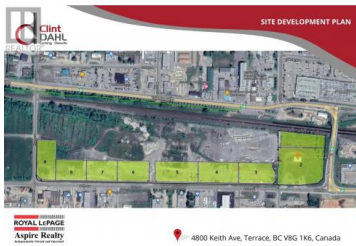
4800 Keith Ave, Terrace, BC V8G 1K6, Canada

4940 KEITH Avenue Terrace British Columbia $1,319,500