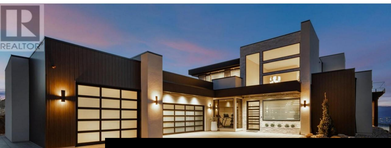
5602 Upper Mission Court Kelowna British Columbia Kettle Valley