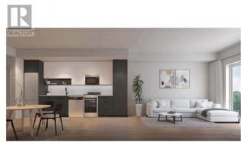
LIVING: REFINED. Areas with low and elevated ceilings with natural light that fills the space from unobstructed windows.