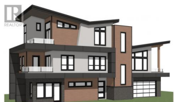
House 2 Option 2