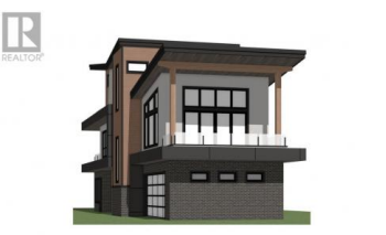
House 2 Option 2 757 Barnaby Road, Kelowna

Prime opportunity to own a large 0.78-acre lot zoned RU4 in the sought-after Upper Mission area, with plans in place for four single-family homes in a bareland strata development. Each home offers two unique design options, allowing for a customized living experience. This desirable location is just minutes from top-rated schools, sandy beaches, renowned wineries, and all the amenities of Kelowna. It's also within walking distance to the New Ponds Shopping Plaza, providing convenient access to shops, restaurants, and more. The four homes are available for purchase as well, with floorplans and development subject to city approval. Please note that the renderings provided are for illustrative purposes only. Utility upgrades have been completed, but buyers are advised to confirm all requirements with the City of Kelowna. Don't miss out on this exceptional development potential in a prime location! (id:6769)