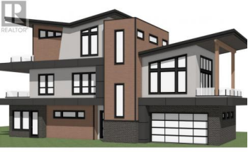
House 2 Option 2 757 Barnaby Road, Kelowna