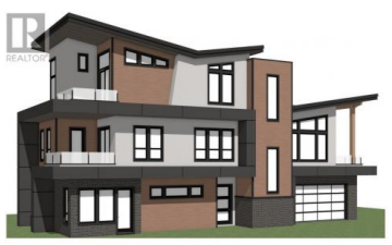
House 2 Option 2 757 Barnaby Road, Kelowna