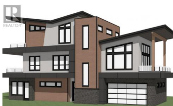
House 2 Option 2