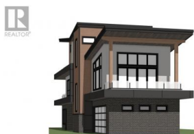
House 2 Option 2