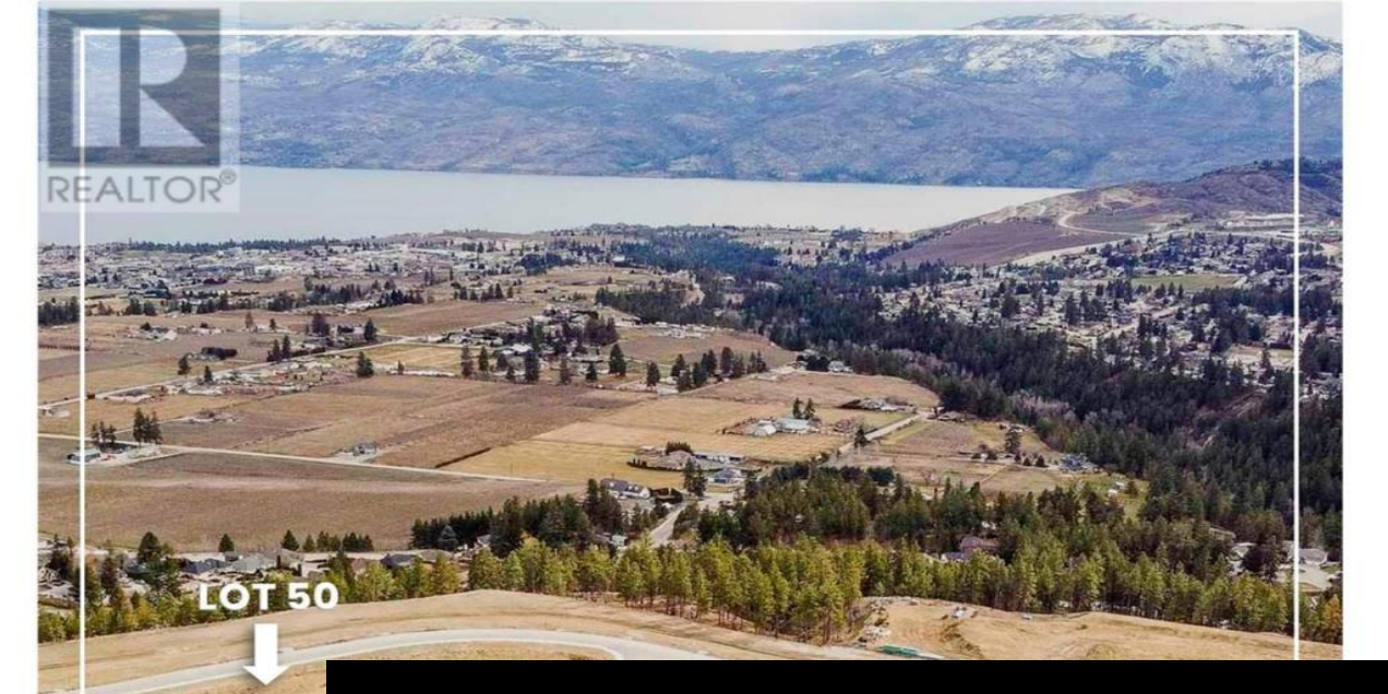
Scenic Ridge Drive West Kelowna British Columbia Smith Creek