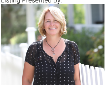
Originally Listed by: RE/MAX Armstrong