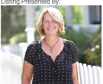
Originally Listed by: RE/MAX Kelowna