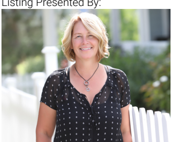
Originally Listed by: Century 21 Assurance Realty Ltd