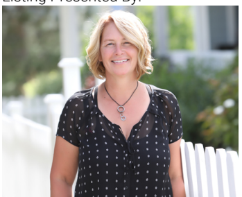
Originally Listed by: Oakwyn Realty Okanagan-Letnick Estates