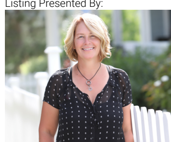
Originally Listed by: RE/MAX Kelowna