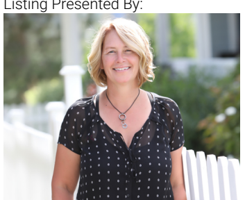
Originally Listed by: RE/MAX Vernon