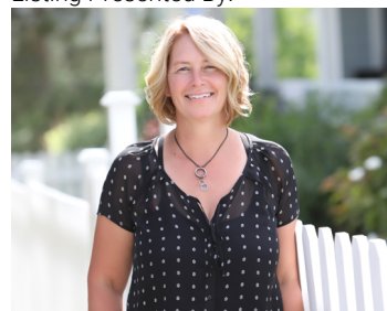
Originally Listed by: eXp Realty (Kelowna)