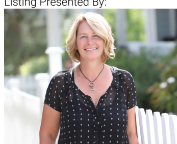
Originally Listed by: Coldwell Banker Executives Realty