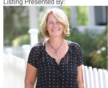
Originally Listed by: Oakwyn Realty Okanagan