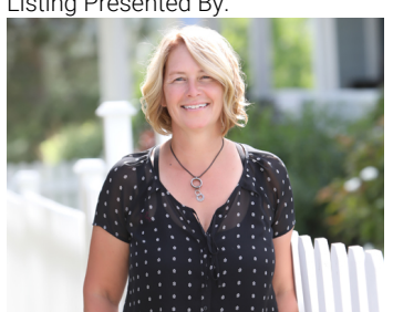
Originally Listed by: RealtyMonX