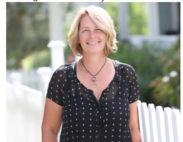
Originally Listed by: Stonehaus Realty (Kelowna)