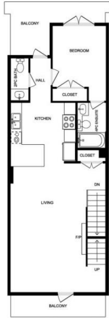
Main Floor 772 SQ.FT