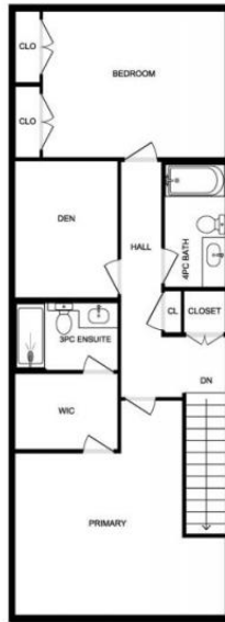
Upper Floor 840 SQ.FT

*Floorplans are intended to give a general indication of the proposed layout only. *All size are not guaranteed, not intended to form part of contract or warranty. E&O Insured.