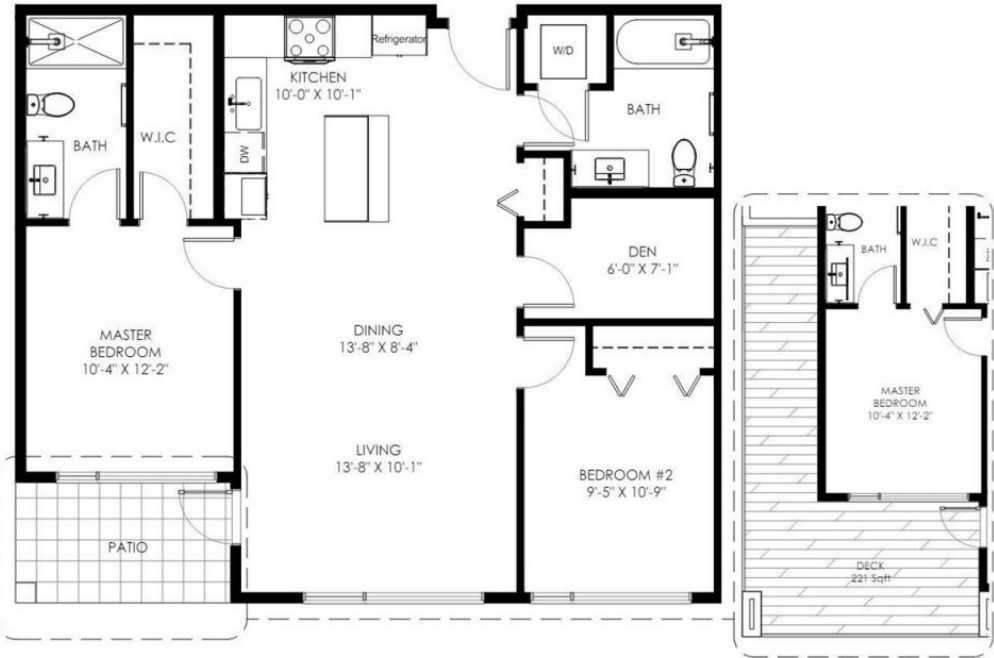
UNIT TYPE 'C4' PLAN L 2 BED+DEN SCALE: 1/4" = 1'-0" UNIT- #115 971.9 Sqft