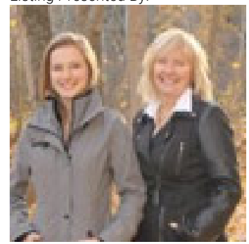
Originally Listed by: Sage Executive Group Real Estate