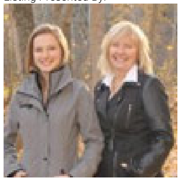
Originally Listed by: Sage Executive Group Real Estate