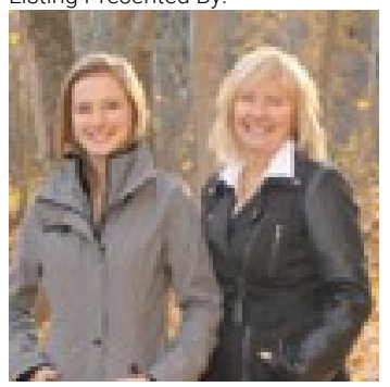
Originally Listed by: Sage Executive Group Real Estate