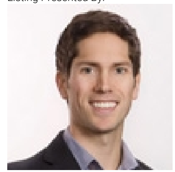
Originally Listed by: Royal Lepage Locations West