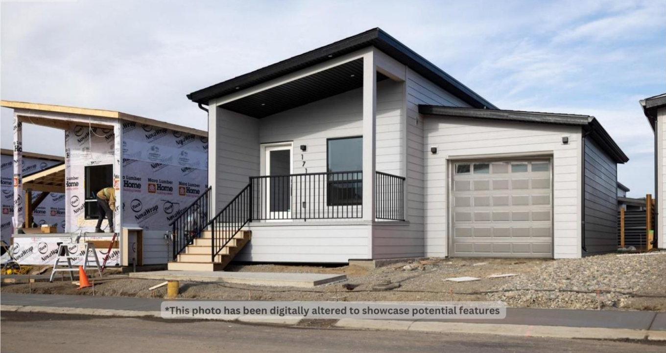
*This photo has been digitally altered to showcase potential features